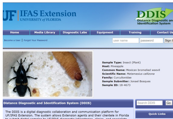
Distance Diagnostic and Identification System (DDIS)