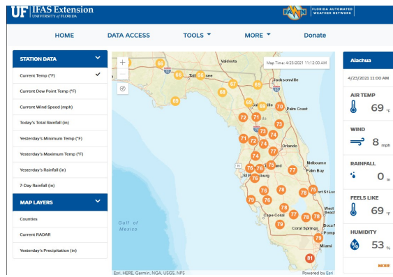
Florida Automated Weather Network (FAWN)

Email the IT Application Team: appteam@ifas.ufl.edu